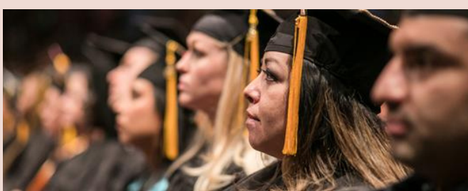
Table 3. Institutional and Student Characteristics at Four-Year Institutions, by MSI Type